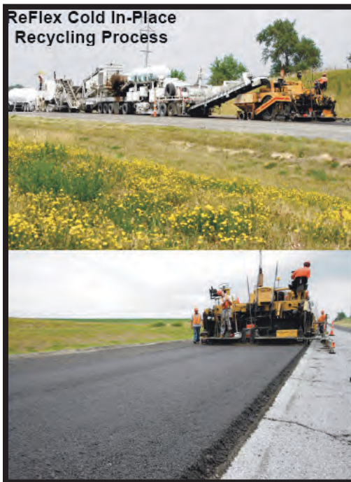
ReFlex Cold In-Place Recycling Process