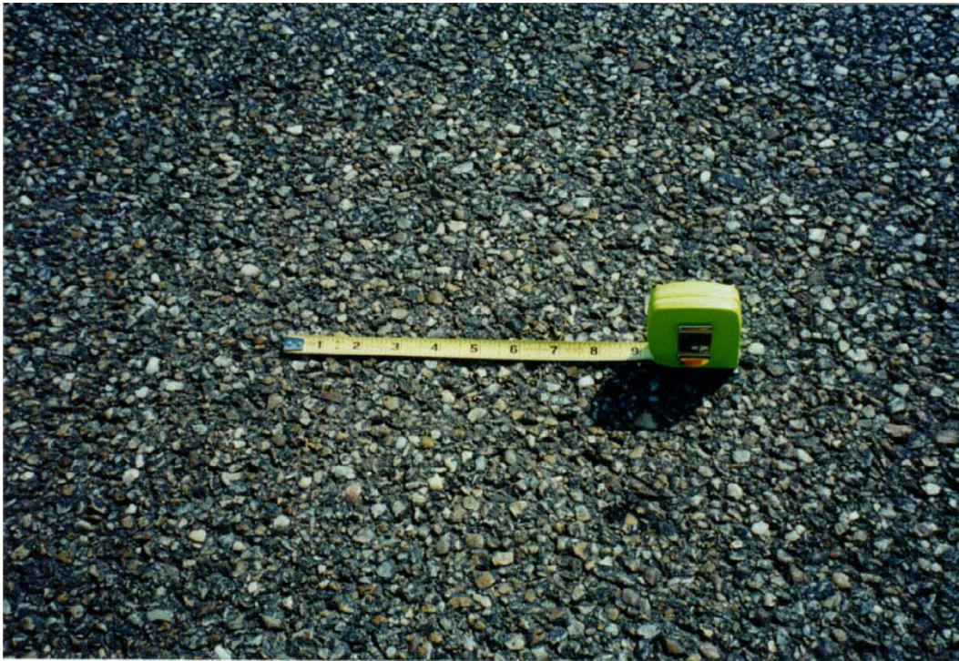
Figure 8. Tallapoosa Project - Closeup of Gravel Novachip Surface After 3-3/4 Years