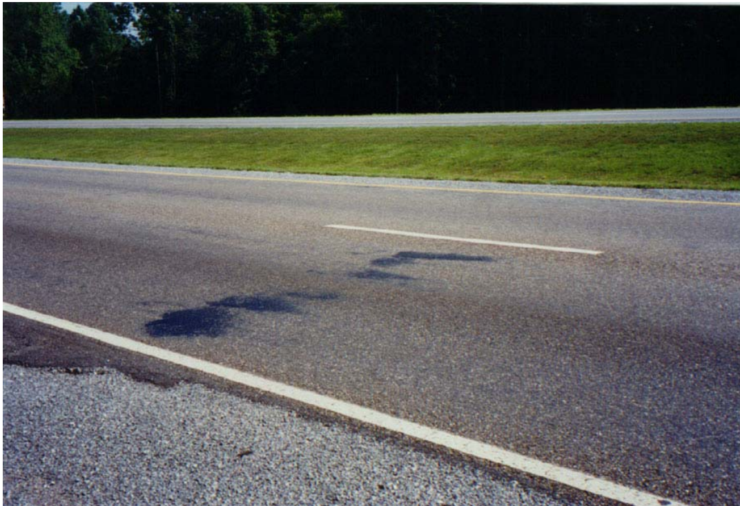
Figure 5. Tallapoosa Project - Flushing Due to Spray Bar Leakage

The 1996 average daily traffic (AADT) on this road is 13,044 with 10-1/2% trucks. No significant loss of Novachip or raveling has taken place in both granite and gravel test sections. This indicates very good adhesion between the Novachip and the underlying surface. As reported earlier, excessive emulsion tack coat puddles had resulted during construction from the leakage of spray bar wherever the machine stopped during paving. The excess emulsion was visible on the surface of the pavement within a year, and it was still evident after 3-3/4 years (Figure 5). This leakage problem was later rectified.