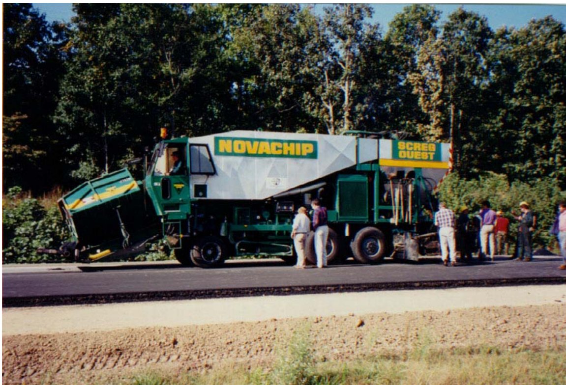
Figure 2. Novachip Paving Machine Used in Alabama