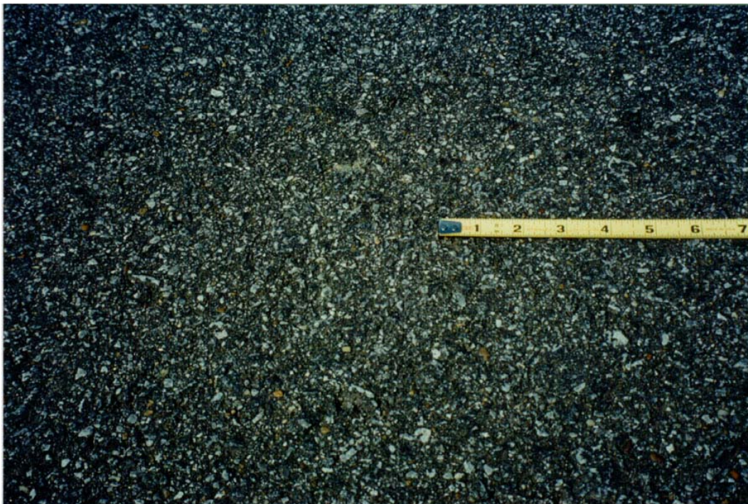
Figure 9. Tallapoosa Project - Closeup of Dense-Graded Wearing Course Mix After 3-3/4 Years