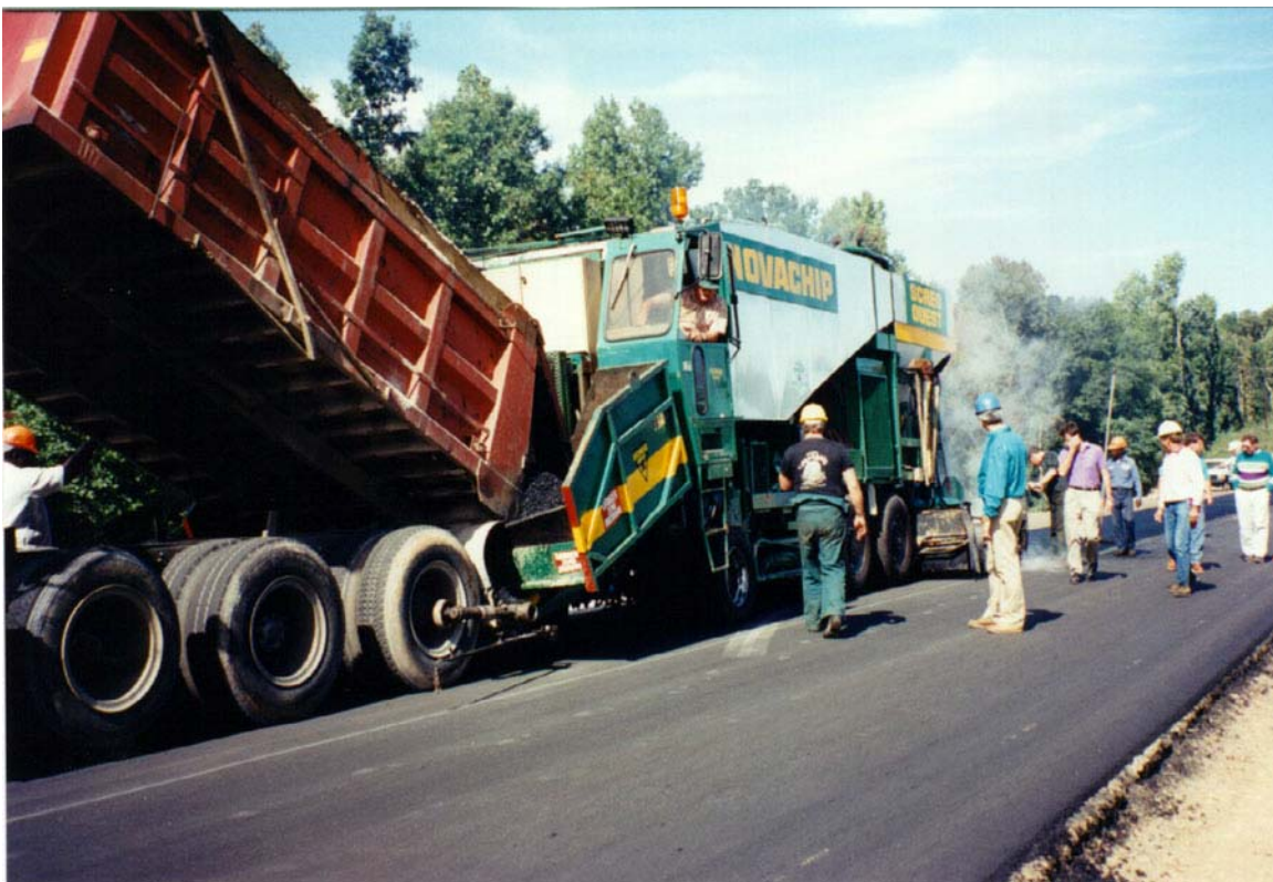
Figure 3. Truck Discharging Mix into Hopper

Novachip paving on this project was accomplished on October 1-2, 1992. The granite Novachip was placed on October 1 followed by the gravel Novachip on October 2. The ambient temperature ranged from 14 to 27°C (58 to 80°F). The machine traveled at a rate of 24-27 m (80-90 feet) per minute. Figure 3 shows a truck discharging mix into the hopper of Novachip machine. The Novachip surface after rolling appeared similar to an open-graded friction course (OGFC). Average rate of the Novachip mix used was 30 kg/m 2 (55 lbs./sq. yd). The following observations were made during the construction.