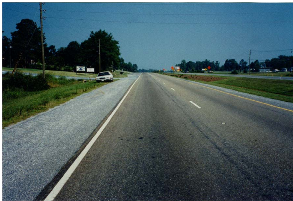
Figure 7. Tallapoosa Project - Gravel Section Showing Slight Flushing in Travel Lane (Left) and no Flushing in Passing Lane (Right)