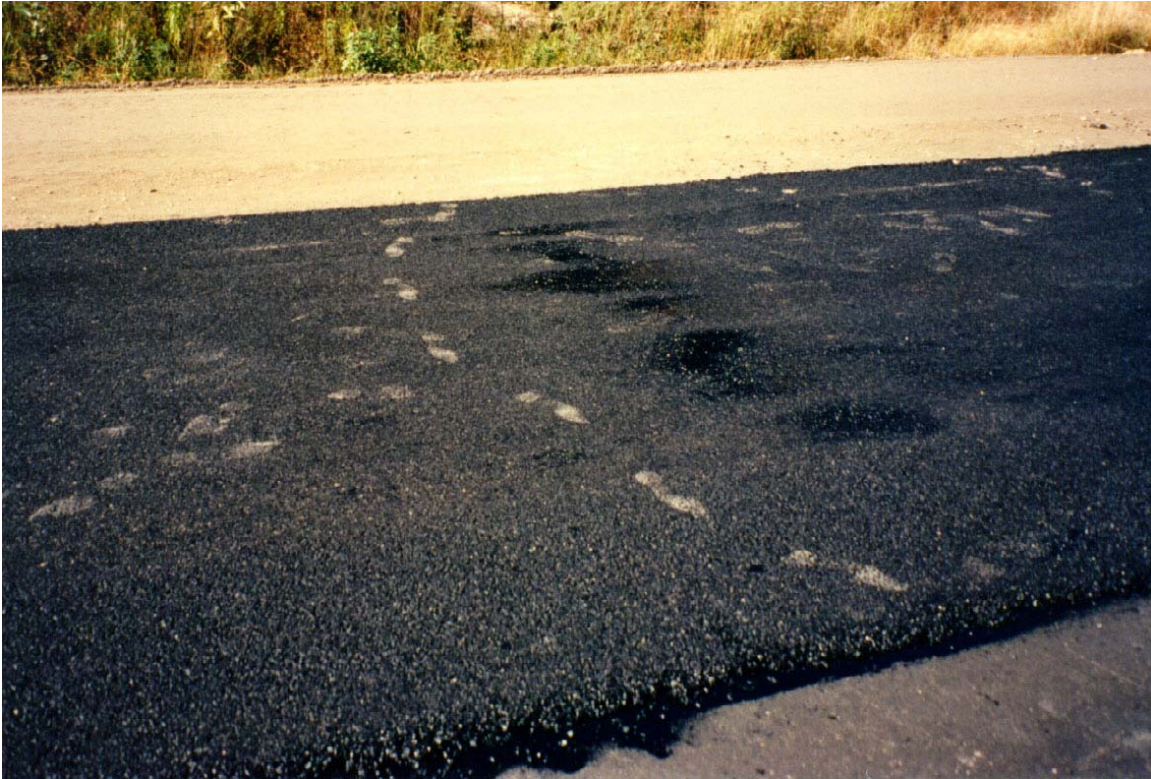
Figure 4. Tack Coat Puddles Where the Machine Stopped