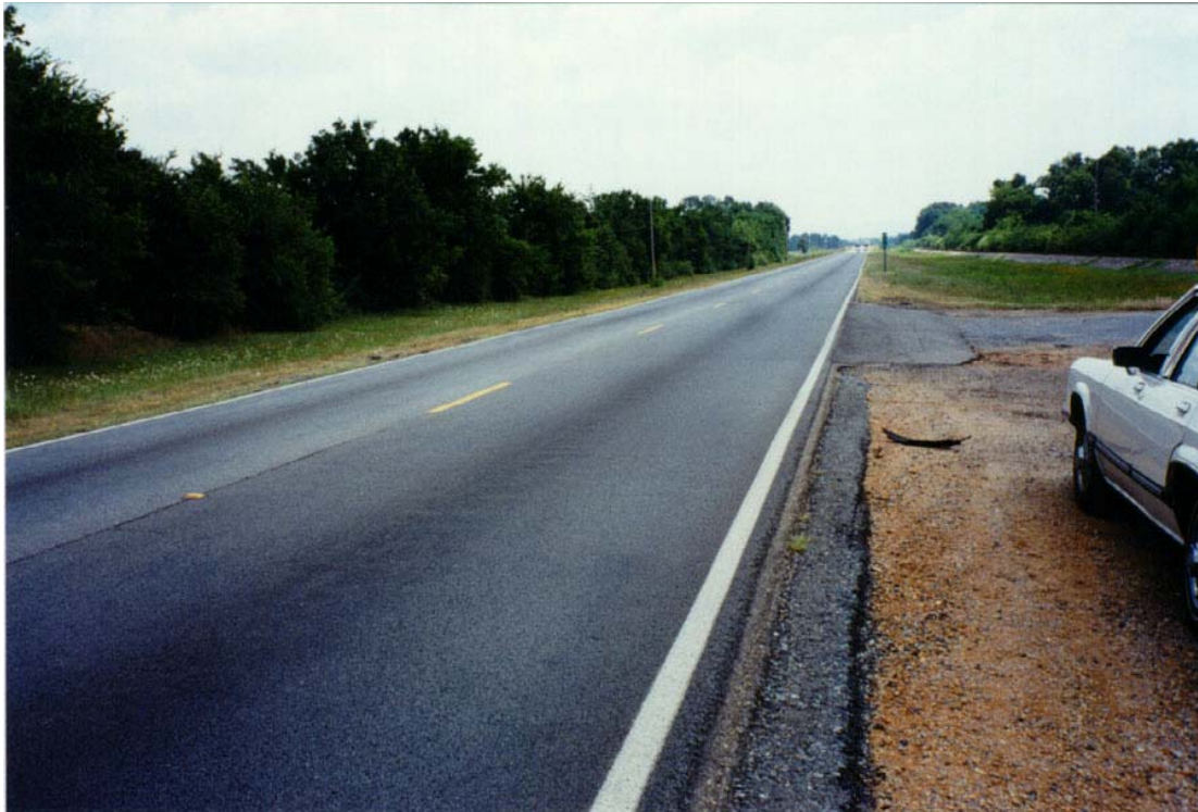
Figure 10. Talladega Project - General Uniform Appearance of Novachip Surface