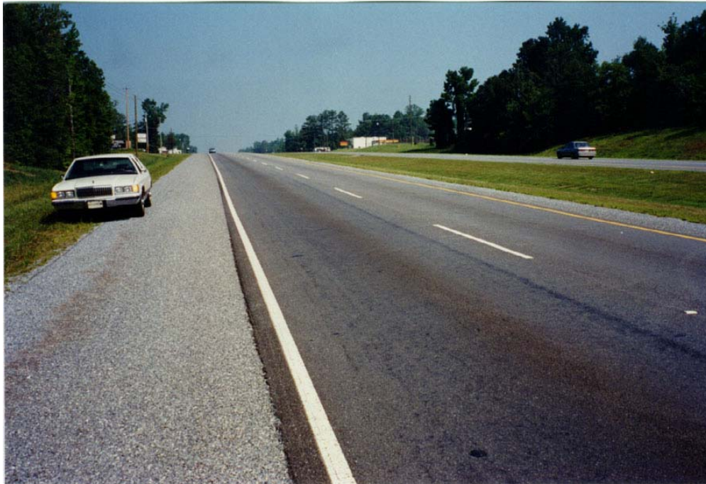
Figure 6. Tallapoosa Project - Granite Section Showing Moderate Flushing in Travel Lane (Left) and Slight Flushing in Passing Lane (Right)